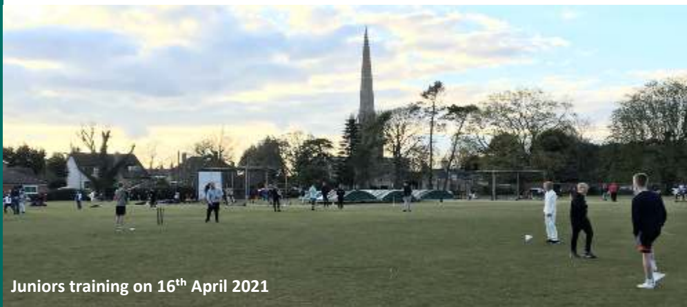
Juniors training on 16 th April 2021

Caythorpe's own Junior Training started on Friday 16th April, with amazing numbers of Boys and Girls attending in each age group.