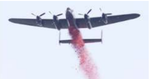
The Prince Philip and the Prince of Wales lead the Royal Salute before the unveiling of the Bomber Command Memorial in Green Park, London, 28th June 2012

This act of remembrance added immeasurably to the poignancy of the occasion. HM The Queen took her leave and was followed by HRH The Prince Philip. As we shook hands I remarked that in our respective uniform we were rather overdressed in the heat. He agreed, so I added, “But you and I are both members of the Savage Club, sir, and we can take it.” He stood back and looked at me with a broad grin, and I saw a wistful, “Oh for a beer” in his eyes.