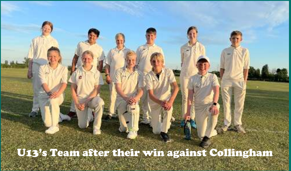
U13's Team after their win against Collingham