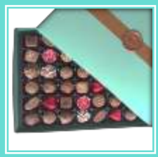
Belgian Chocolate Gift Boxes and Flowers