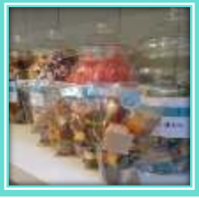
Pick n Mix and Fudge