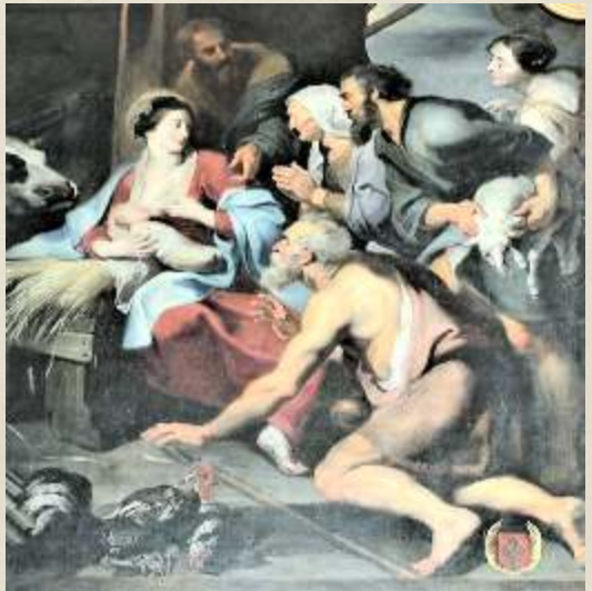
The Adoration of the Shepherds, by Rubens in Soissons Cathedral.

And is it true? For if it is . . . . . No love that in a family dwells, No carolling in frosty air, Nor all the steeple-shaking bells Can with this single Truth compare --- That God was Man in Palestine And lives to-day in Bread and Wine.