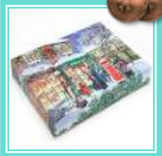
Advent Calendars & Christmas Novelties