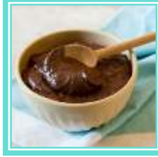
Chocolate making sessions & birthday parties